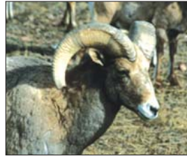
Rams must be 1/2 curl or larger.