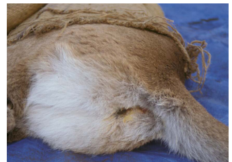
Female mountain lion hindquarters

FEMALES have only two spots below the base of their tail, including the anal opening hidden beneath the base of the tail and vaginal opening directly below the anus. The rest of the area behind the female's hindquarters is covered with white fur.