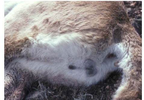
Male mountain lion hindquarters

Beneath the scrotum is a small, conspicuous black spot (about 1 inch across) that surrounds the penis sheath opening.