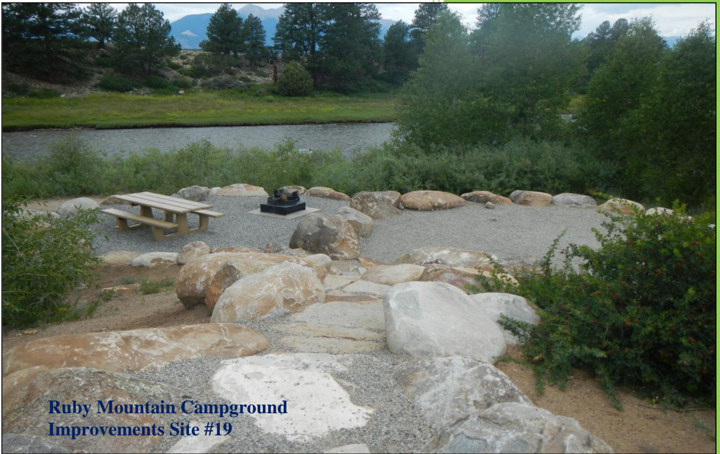
Ruby Mountain Campground Improvements Site #19