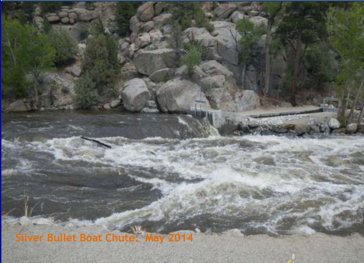
Silver Bullet Boat Chute: May 2014