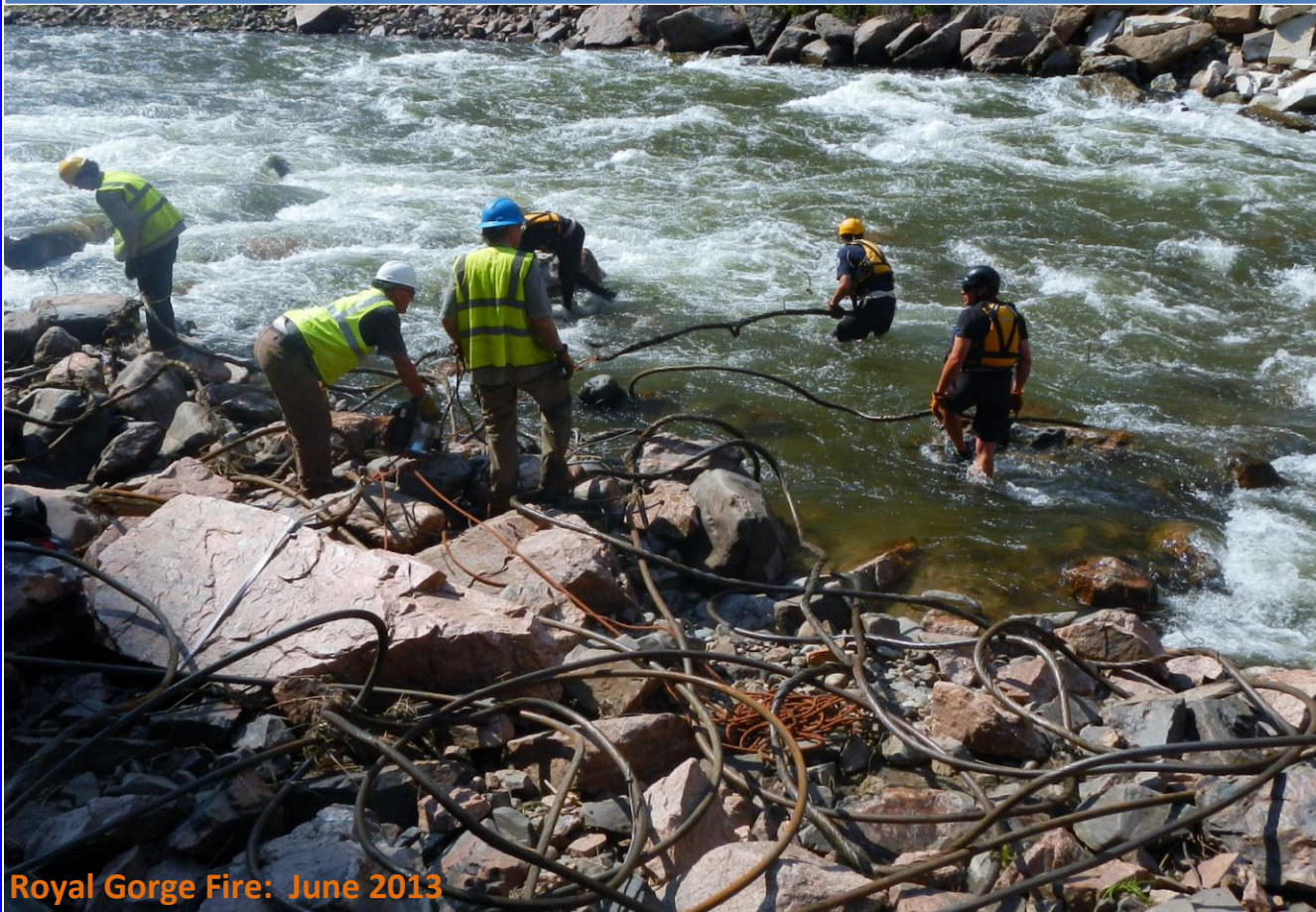
Royal Gorge Fire: June 2013