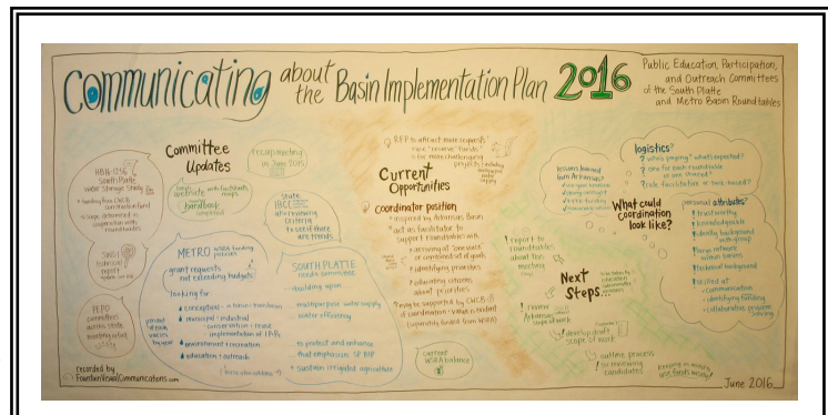
Metro/South Platte joint meeting visualization

Developed a handout on Colorado's Water Plan and the Gunnison Basin Roundtable Basin Implementation Plan for use by roundtable members and partner organizations to conduct education and outreach.