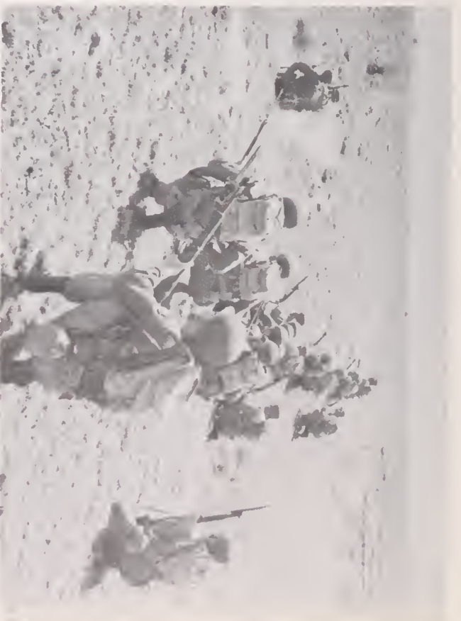
BEFORE THE ATTACK