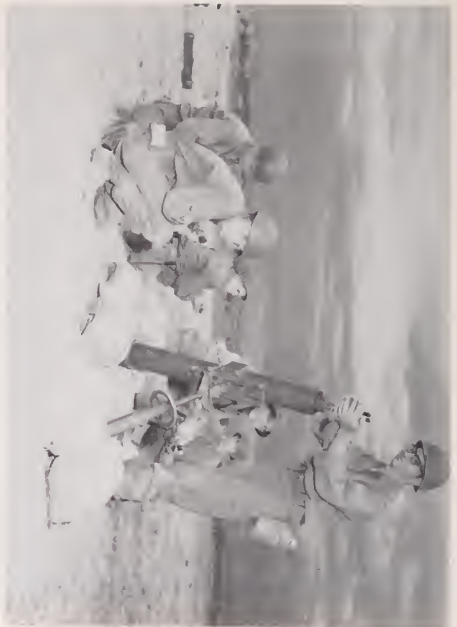
SUB-CALIBER MORTAR FIRING