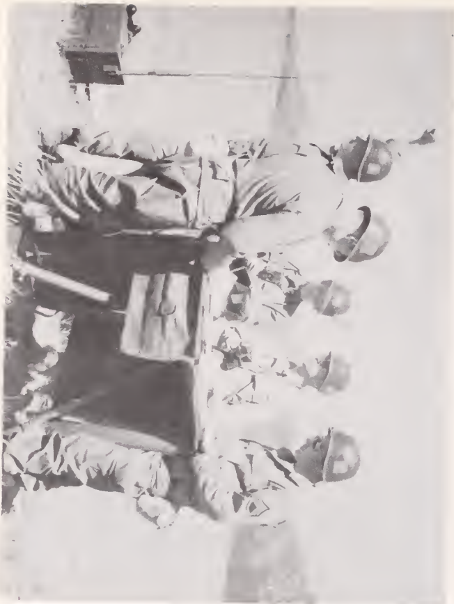
FIRE DIRECTION CENTER