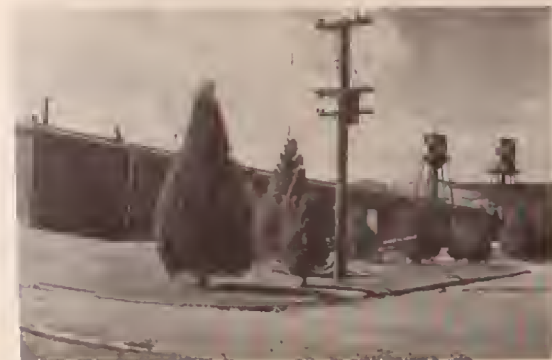
GARAGE AND ELEVATED WATER TANKS