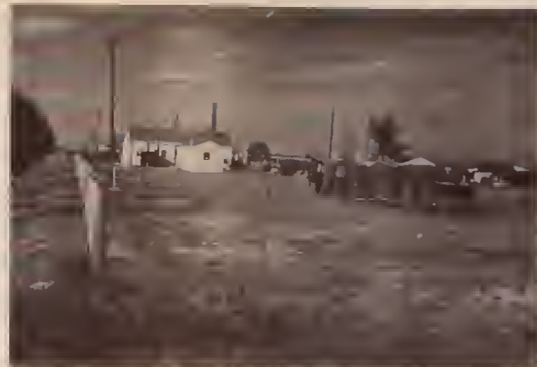
MOTOR POOL—BUCKLEY FIELD