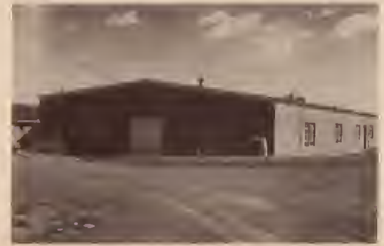
MOTOR VEHICLE STORAGE BUILDING