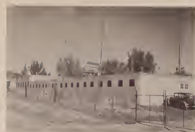
TACTICAL AIR DIRECTION CENTER—DENVER