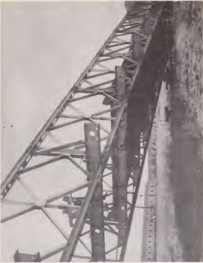
SURVEYING THE JOB