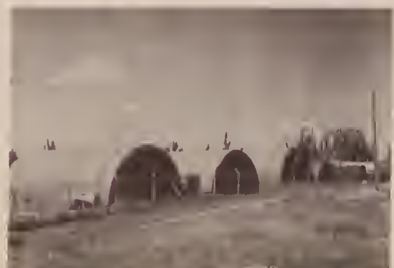
JAMESWAY SHELTERS—RADAR SITE—DENVER