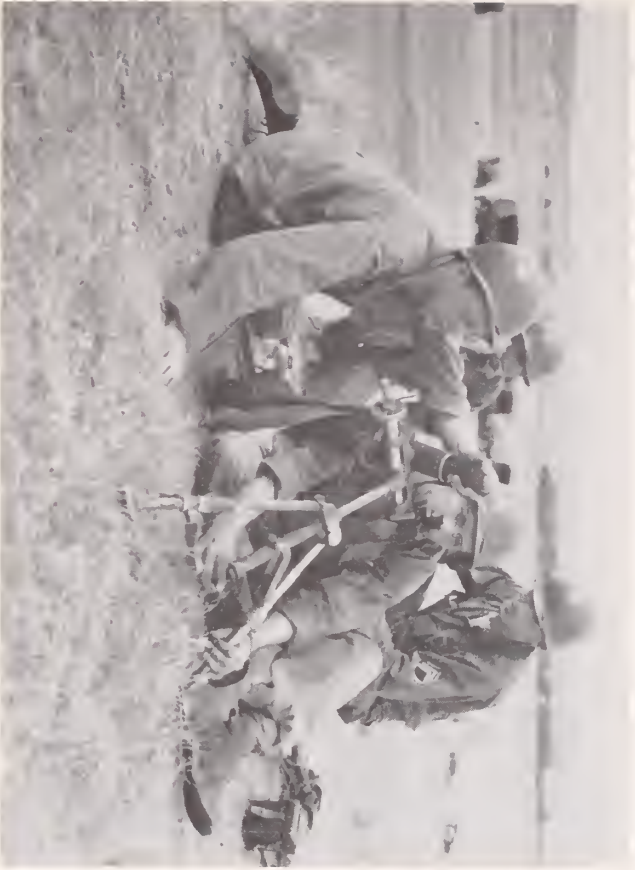
FIRING DUMMY ROUNDS