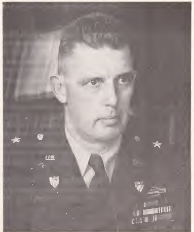
BRIGADIER GENERAL IRVING O. SCHAEFER THE ADJUTANT GENERAL COLORADO NATIONAL GUARD