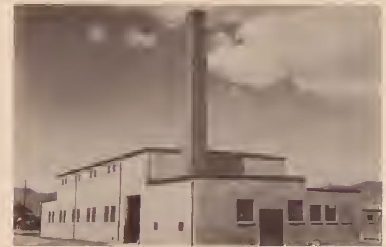
ORDNANCE MAINTENANCE SHOP