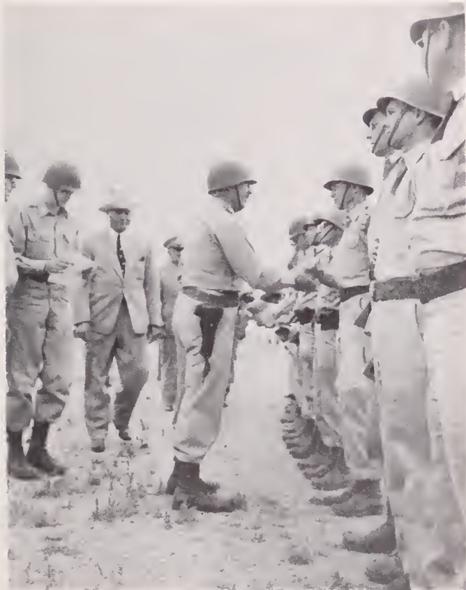
PRESENTATION OF AWARDS