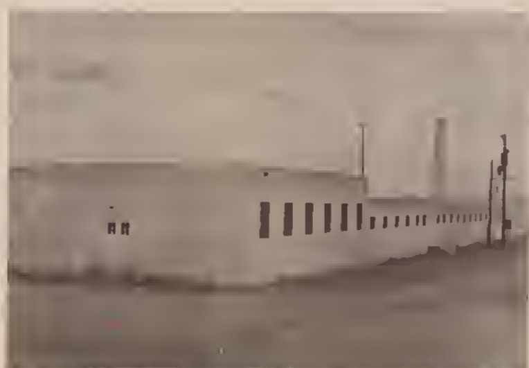
TACTICAL AIR DIRECTION CENTER—BOULDER