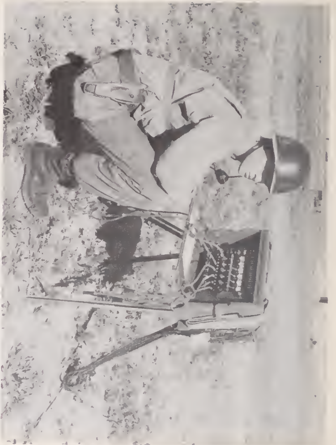
SWITCHBOARD OPERATOR — FIELD