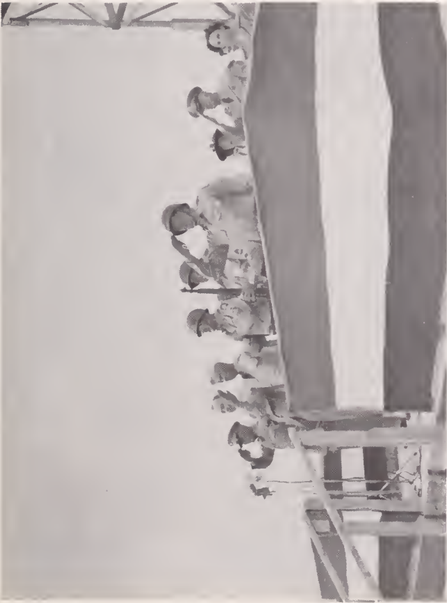
THE REVIEWING STAND