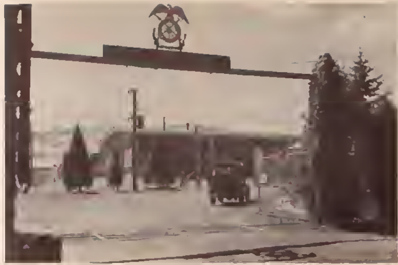
SOUTH ENTRANCE GATE