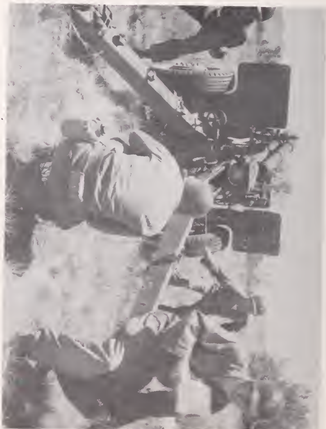
CREW IN ACTION