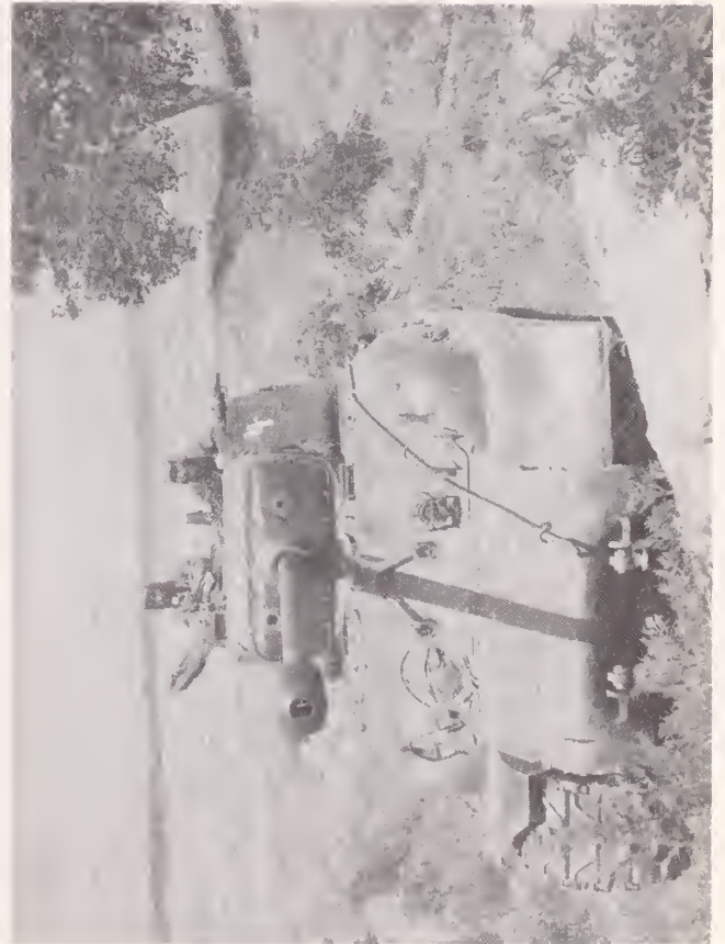
TANK PLATOON COMMANDER