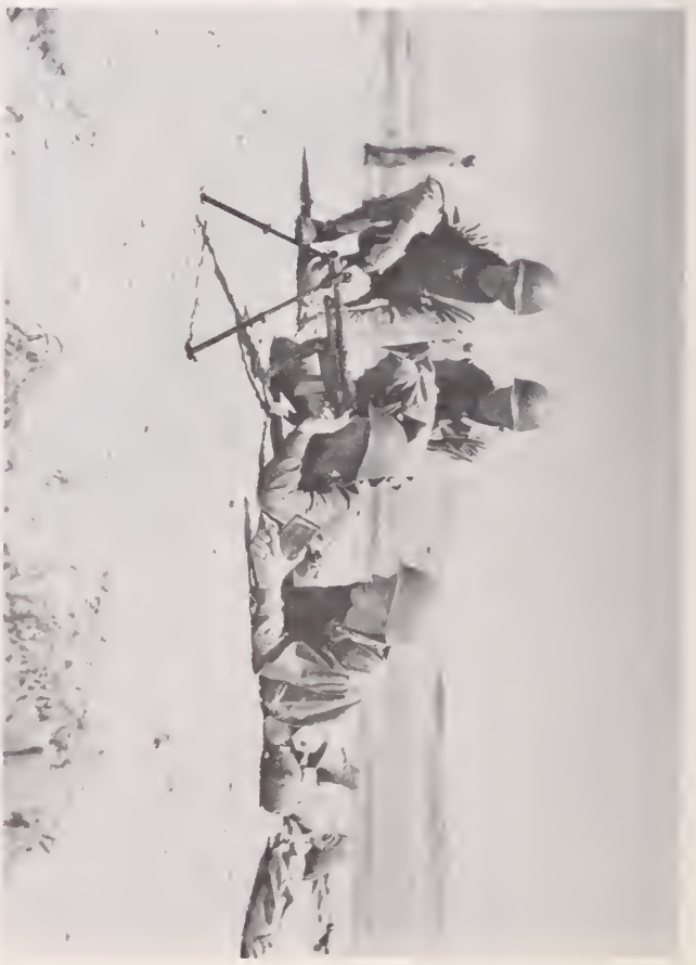
AUTOMATIC RIFLE PRACTICE