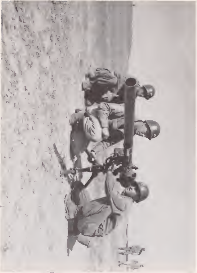
RECOILLESS RIFLE PRACTICE