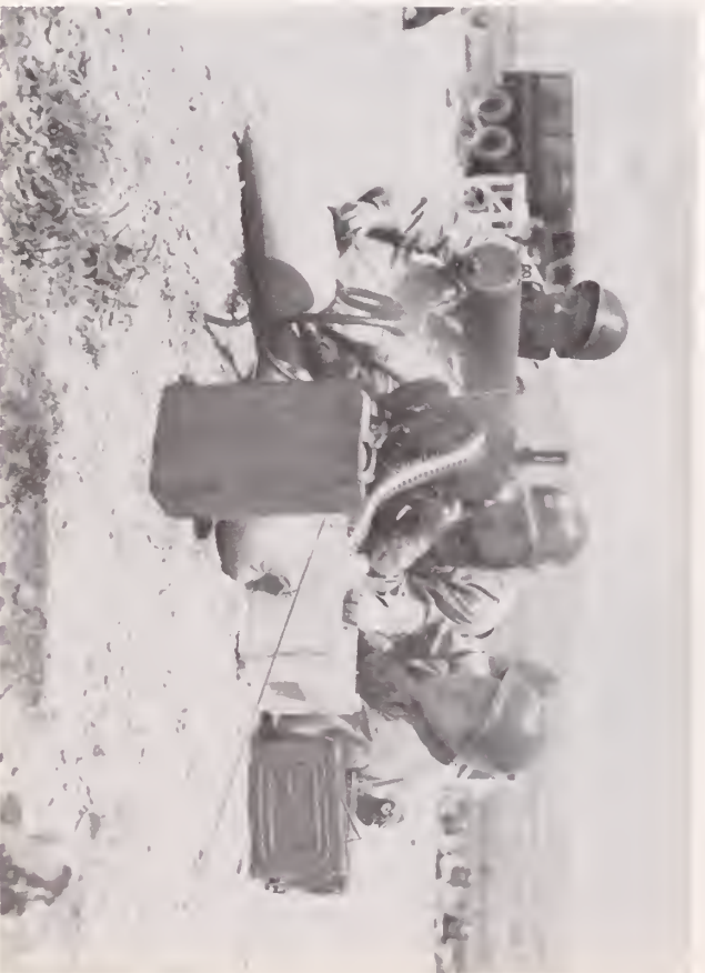
MACHINE GUN PRACTICE