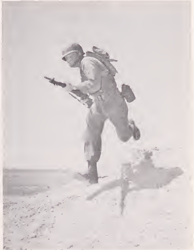
OVER THE TOP