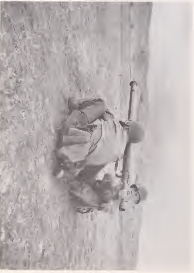
ROCKET LAUNCHER FIRING