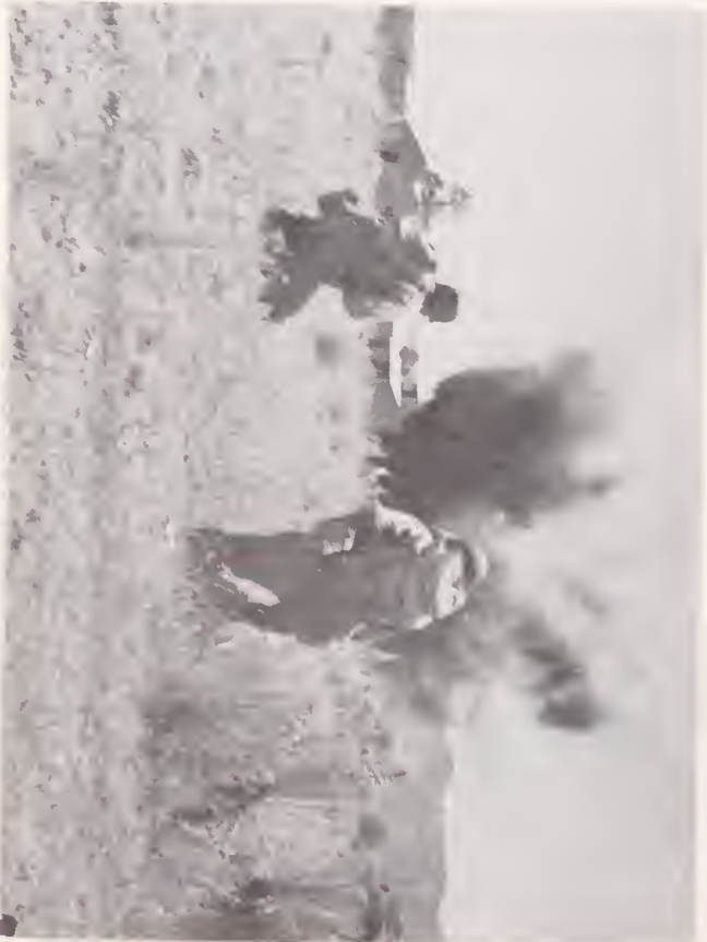
PREPARATION FOR ATTACK