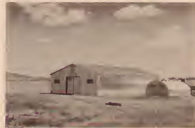
HANGAR AND PARTS BUILDING—AIRPORT