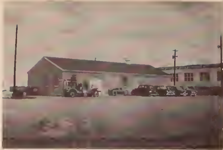
ARMAMENT BUILDING—BUCKLEY FIELD