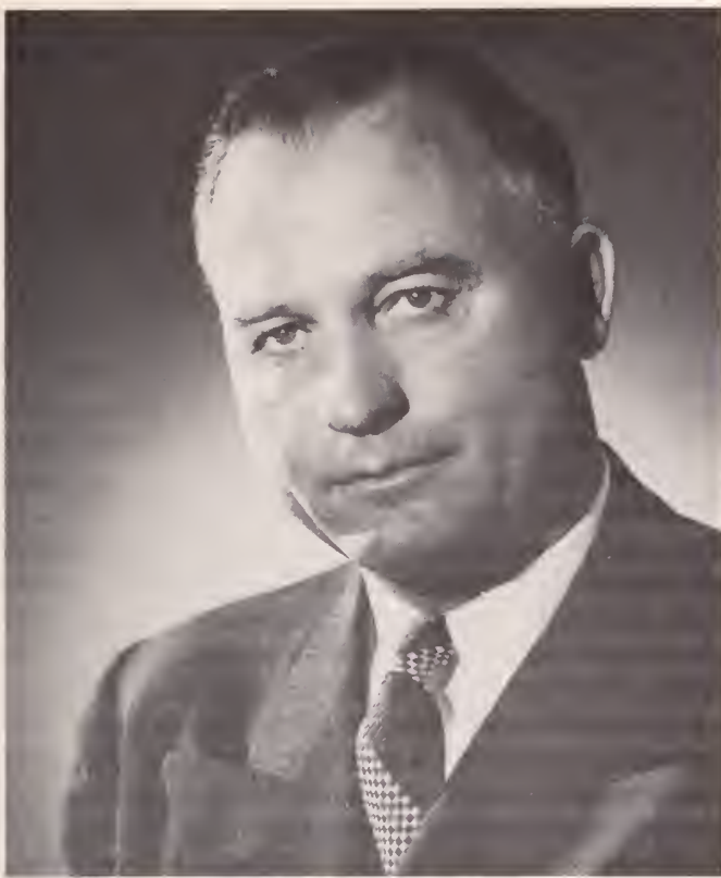
THE HONORABLE DAN THORNTON GOVERNOR OF COLORADO COMMANDER-IN-CHIEF COLORADO NATIONAL GUARD