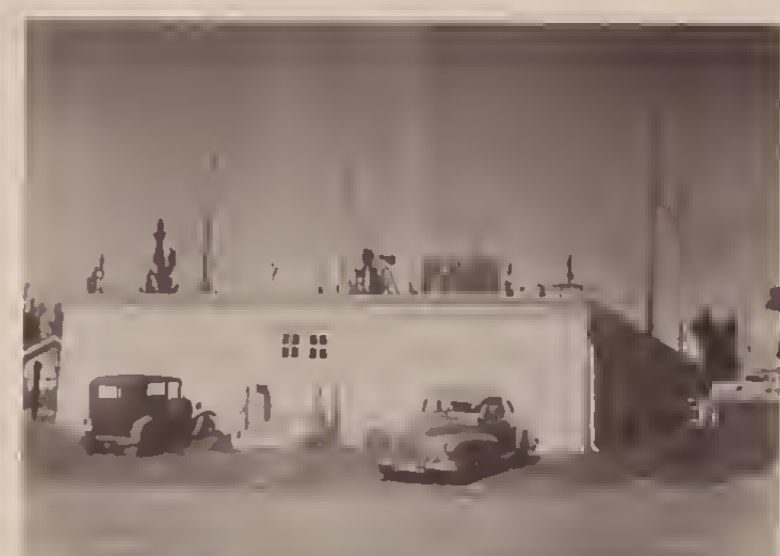
TACTICAL AIR DIRECTION CENTER—DENVER