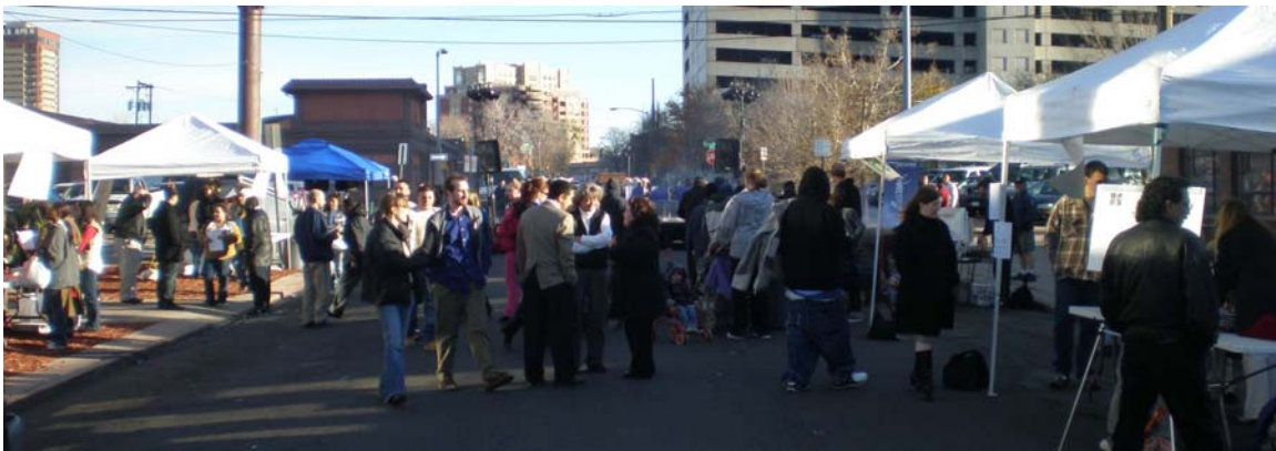
Youth receive services at the Colorado Homeless and Runaway Youth Awareness Month Kickoff Event on November 6, 2008.

The Homeless Youth Coordinator has primary responsibility for facilitating the overall plan implementation and monitoring progress towards the objectives. The ACHY created workgroups, representing each one of the five aforementioned priority areas, to complete specific action steps and to make necessary recommendations. Several other key youth initiatives have partnered with OHYS to collaboratively implement many of the plan strategies.