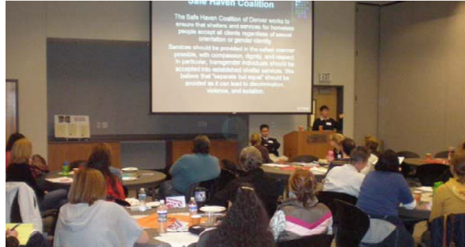
2008 Homeless and Runaway Youth Awareness Month Provider Training Forum