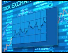
Zika Virus & Disease Related Investment Scams