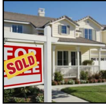
Rental Scams Rise