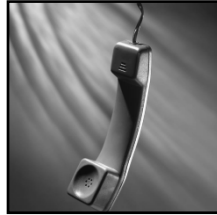
Robocalls Gone Wrong