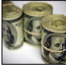
Foreign Lottery Scams