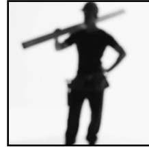
Common Spring Scams