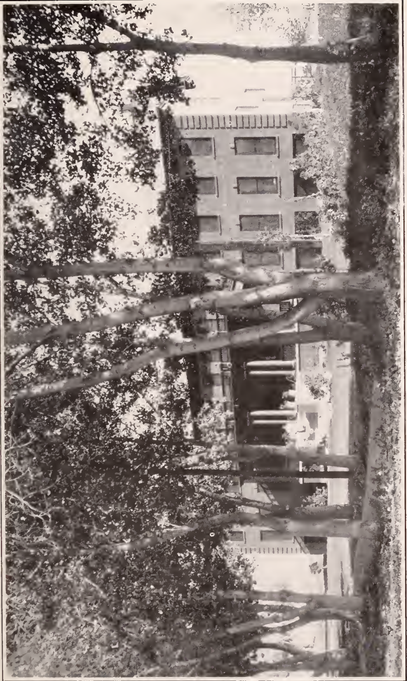
PURCELL COTTAGE, OPENED OCTOBER, 1921