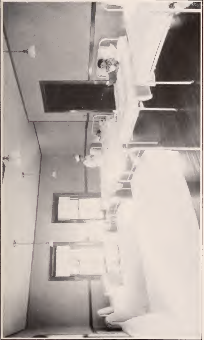
WARD AT HOSPITAL