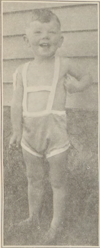
A FUTURE ATHLETIC INSTRUCTOR

ONE OF OUR BOYS IN BUSINESS FOR HIMSELF.