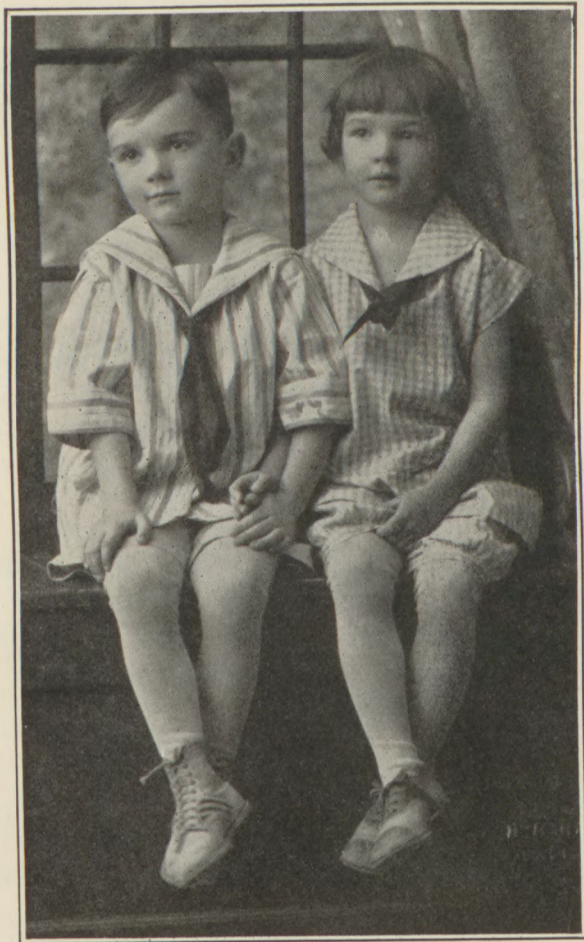
TWO OF THREE CHILDREN ADOPTED IN ONE HOME