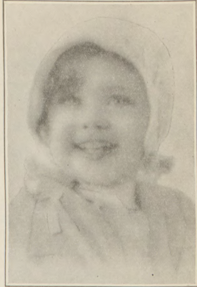
A LITTLE ROSE BUD- THE FOSTER PARENTS WILL NOT GIVE AWAY.

ONE OF OUR BOYS IN BUSINESS FOR HIMSELF.