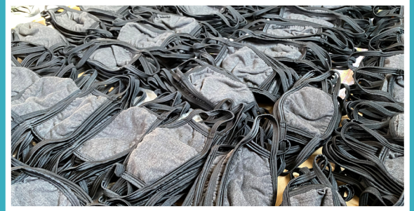
Masks distributed to child protection workers in Colorado

The child protection community is responding to new challenges presented by the pandemic. During the fiscal year, we worked to support those who look after Colorado's children by identifying and fulfilling needs. Below are highlights from several of our efforts.