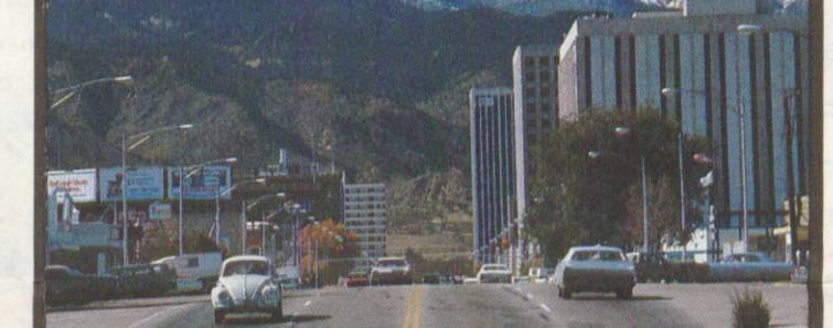
COLORADO SPRINGS AND PIKES PEAK.