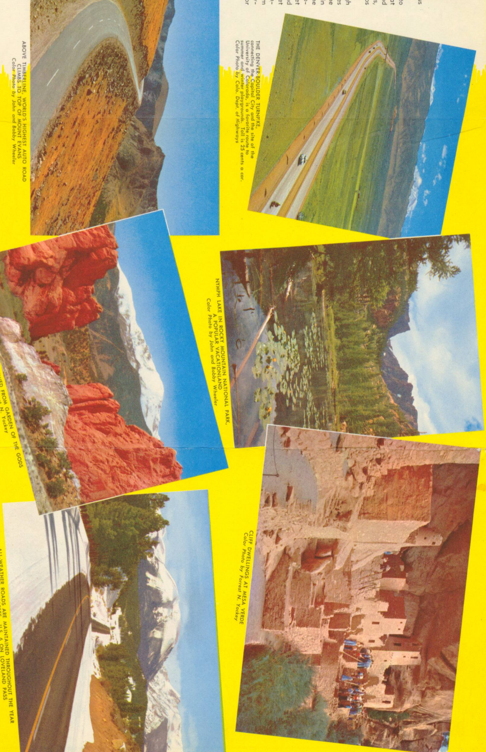
ABOVE: TRAVELING WORLD'S HIGHEST AUTO ROAD THROUGH TOP OF MOUNT PEARL COLORADO DEPARTMENT OF HIGHWAYS