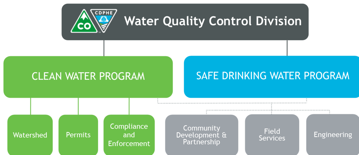
Figure 2. Organization chart for the Water Quality Control Division highlighting core and shared work sections.

The work to support water quality management processes is divided across multiple groups within the division. This includes several sections that are shared between the clean water and safe drinking water programs (gray in the figure below). The only shared work area without a stand alone summary section in this report is the community development and partnership section. This group works with the Colorado Water Resources and Power Development Authority to provide funding to implement water pollution control infrastructure projects for domestic wastewater treatment facilities to meet the goals of the federal Clean Water Act and Colorado Water Quality Control Act.