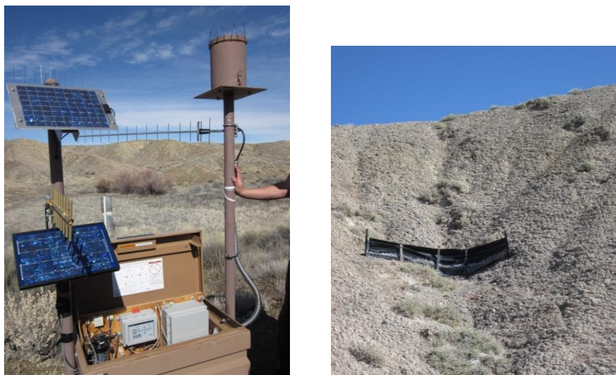
Figures 1 and 2: Badger Wash Monitoring near Mack, CO

The USGS has been monitoring hill-slope erosion using silt fences since 2008 and analyses of cumulative sediment production conducted through 2012 indicate grazing treatments differences are persisting but vary with topography. Silt fence locations and new weir locations have been selected and archeological clearances obtained with installation expected in October 2013. A publication is due out soon. USGS also implemented dust monitoring.