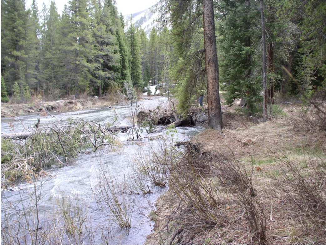
Figure 3: Slate River near Crested Butte, CO

BLM is also an active participant in an EPA/WQCD nonpoint source project to develop a watershed plan in North Park near Walden, CO.