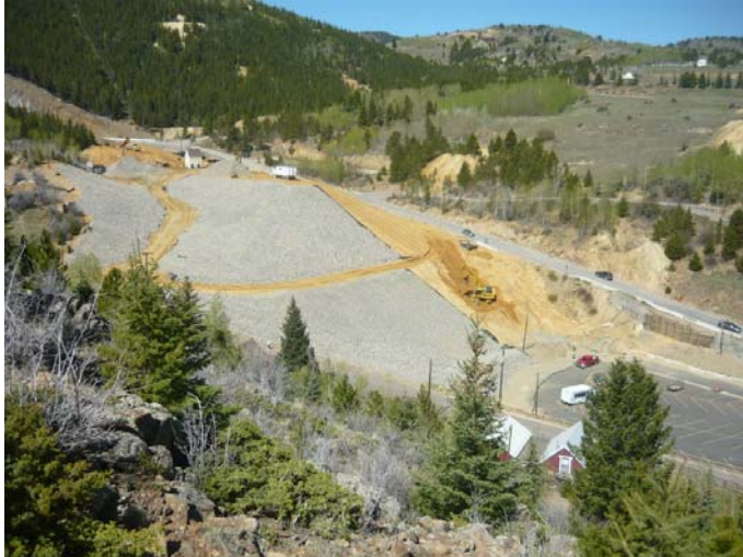
The Quartz Hill project also replaced 1,000 feet of deteriorated storm sewer, reducing Central City's maintenance costs.

from above, crews will dig a "run-on" ditch to channel water around the pile. The mine waste can be capped with inert rock or a vegetated soil cover. Some piles are stabilized further with rock, or "riprap," around the base, or "toe."