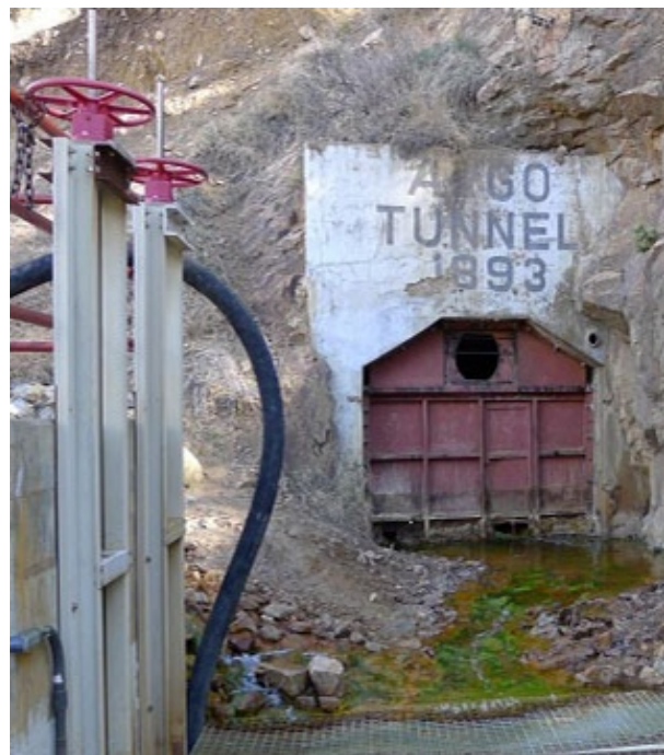
A significant amount of accumulated sediment was removed from the Argo Tunnel portal, making the adit accessible to water treatment plant personnel.

The new Argo Tunnel Flow Control Bulkhead was completed in August 2015 at a cost of approximately $900,000. A pipe runs through the concrete plug so water treatment plant operators can regulate the flow and control water levels inside the mine pool. The tunnel has a history of surge events that released acidic metals-laden mine water to the environment. The first recorded event occurred in 1943 when miners intercepted and released a large volume of naturally impounded water, killing four miners. A second event occurred naturally in 1980. An unknown volume of contaminated water that had been stored was released and entered Clear Creek from the tunnel portal. The surge event forced the closure of six drinking water intakes located within the Golden area. The bulkhead will prevent future surge events from impacting Clear Creek and control flow volume to the plant, resulting in reduced costs.