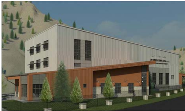
Construction has begun on the North Clear Creek Water Treatment Plant.

The Central City/Clear Creek Superfund Site epitomizes many of the issues that plague mining remediation sites across the West: Draining mines and adits, acid rock drainage from waste rock and tailings piles, heavy metals contaminating groundwater and surface water, impaired fish and aquatic life populations, and historic structures in need of preservation. As a result, the site also employs remedial features and strategies typical of mining-impacted sites: Active water treatment, engineered waste pile covers and drainage systems, sediment-control structures, bulkheads, removal actions, and waste rock repositories.