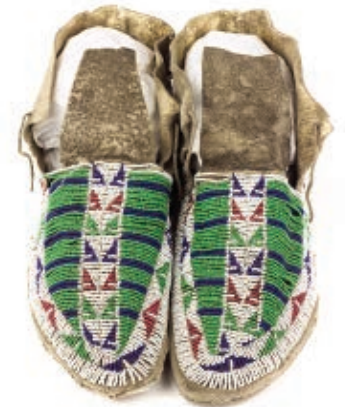
Ute moccasins, late 1800s. 81.98.4. On view in Backstory: Western American Art in Context .