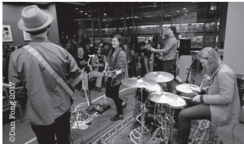
The Still Tide performs in the Stephen Hart Library & Research Center at the History Colorado Center as part of our Tiny Library Concert series generously supported by Airshow, Inc.

100% of teachers surveyed said they'd bring their students back to the History Colorado Center!