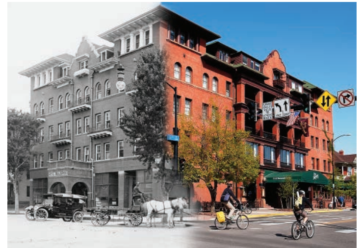
Our expanding Tours and Treks program hosted more than 2,300 tour-goers this year on outings like "Ghosts of Boulder: Halloween Haunts" on Halloween day of 2016.