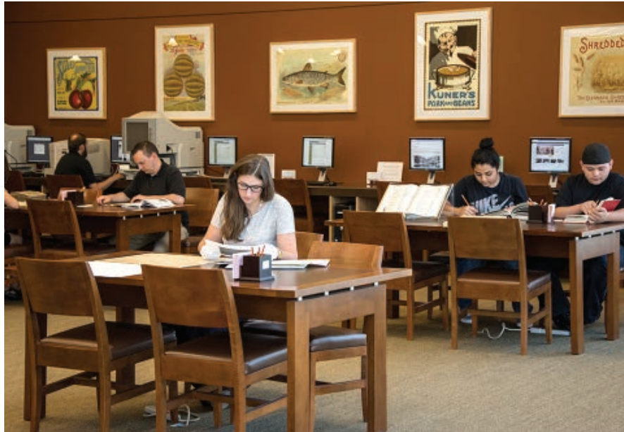
The Stephen Hart Library & Research Center is the portal to History Colorado's collections of historic photography, artifacts, books, documents, and other resources.