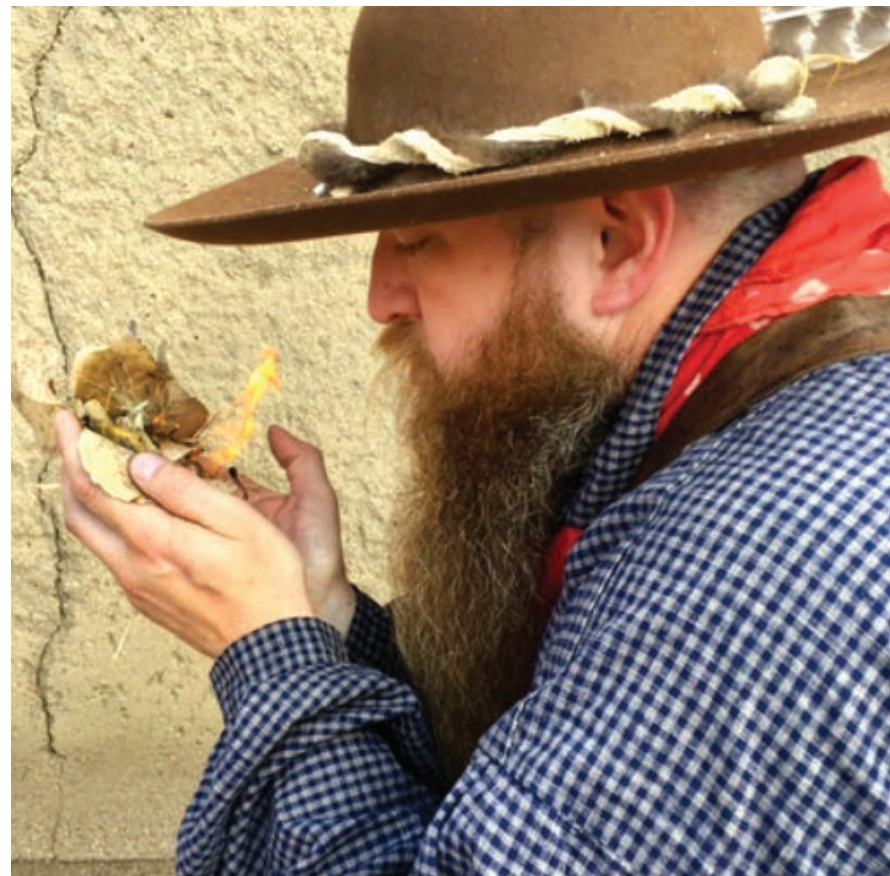
Fort Vasquez in Platteville has reopened with all-new exhibits and an ongoing series of living-history days.

Be watching for new Mission, Vision, and Values statements that reflect our priorities and ambitions as we move forward—with your most generous support—along these exciting new paths for History Colorado.