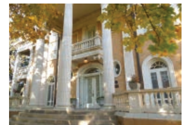
The Grant-Humphreys Mansion in Denver

The Grant-Humphreys Mansion was honored with the 2017 Wedding Spot Award as one of the best wedding venues in Colorado, from a pool of more than 13,000 venues.