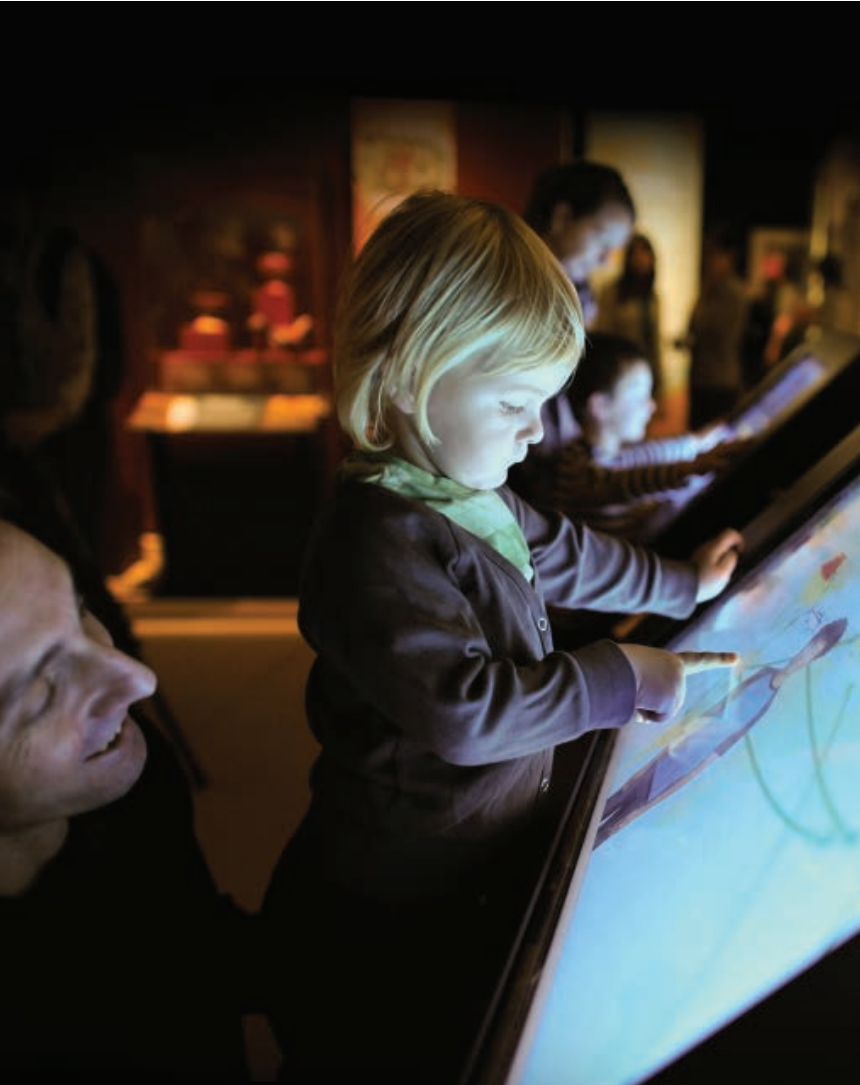
Food: Our Global Kitchen brought an exploration of the world's food to the History Colorado Center.