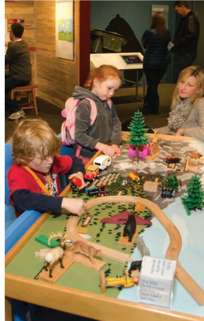
Living West teaches stewardship of Colorado's mountains.

History Colorado strives to produce the Annual Report donor and giving member recognition lists without errors or omissions. If we have made a mistake, we apologize and appreciate your calling it to our attention. Please contact us at 303/866-4477 or development@state.co.us .