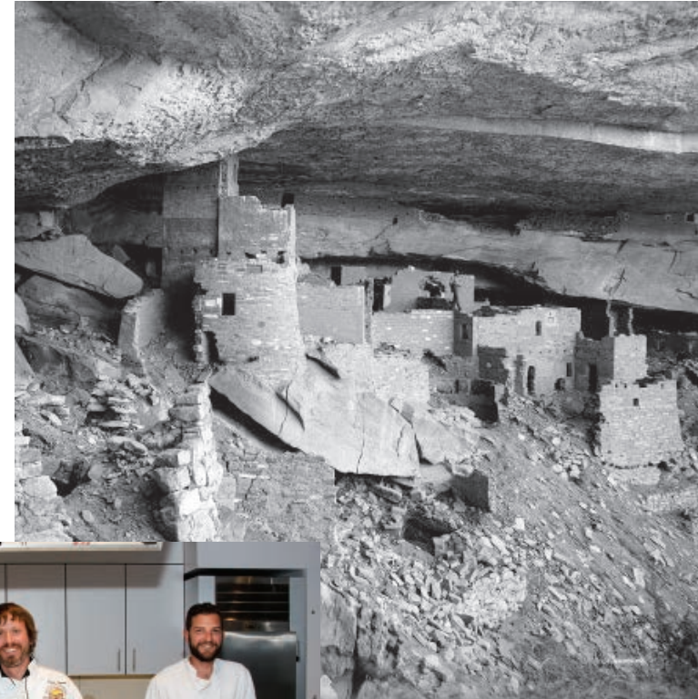
Living West looks at the ways Coloradans have adapted to their state’s challenging ecosystems.

And at El Pueblo History Museum, Black Hills Energy sponsored Children of Ludlow: Life in a Battle Zone, 1913–1914 . Developed with input from descendants of those touched by the Ludlow tragedy, this critically acclaimed and award-winning exhibit presents the experiences of the children who lived in the turbulent environment of the Ludlow tent colony.