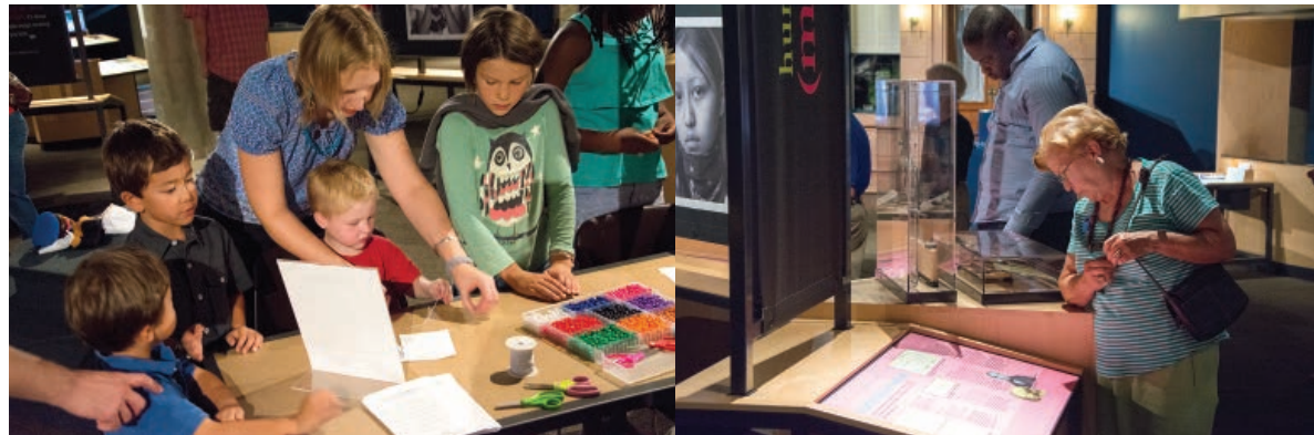
Families visit RACE: Are We So Different? at the History Colorado Center.

Like most history museums, History Colorado has done little intentional collecting of materials post-World War II. In the coming year, we'll begin building a collection that will help our successors understand the profound changes contemporary Colorado has undergone. These new oral histories, archival materials, and artifacts will serve as the foundation for exhibits and civic engagement programs that explore our recent past and our complex present.