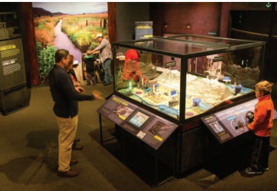
The Living West exhibit