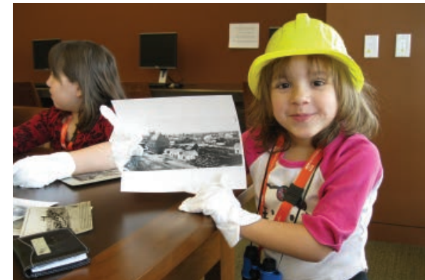
Behind the scenes at the History Colorado Center