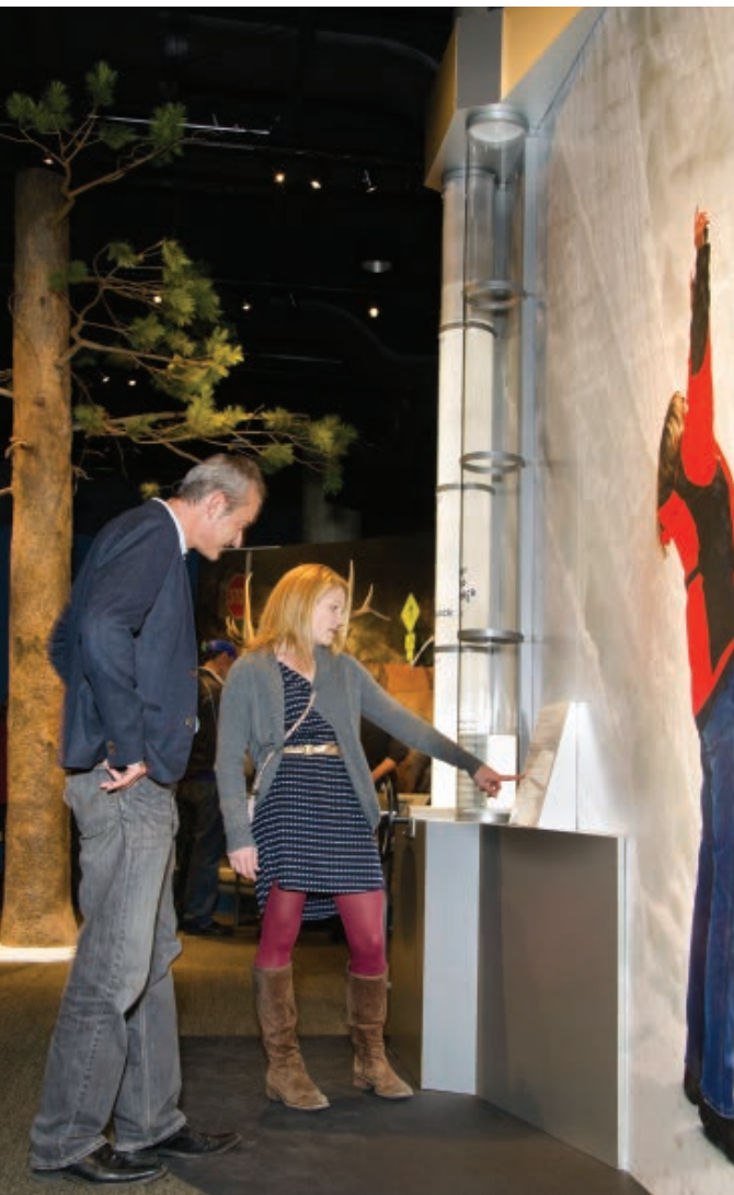
Measuring snowpack in Living West