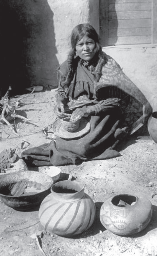
Living West explores ancestral Puebloans and their descendants