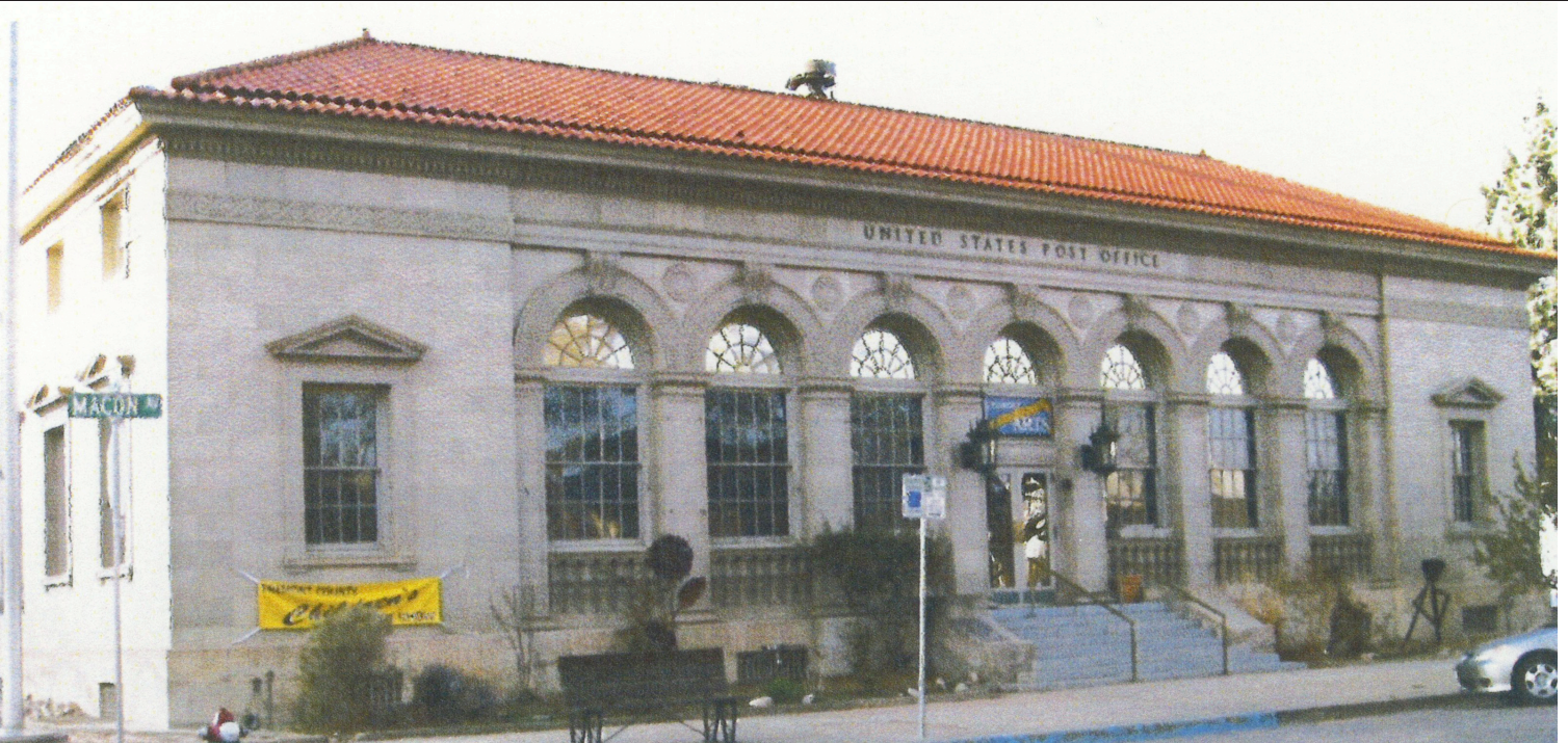
Top: Post office and Federal Building - Canon City Right: Cardinal Station-Cardinal Mill and Mine Site, Boulder County