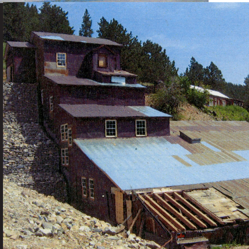
Front Cover Top Left: Archaeological Assessment - La Plata County Top Right: Georgetown School, Clear Creek County Bottom Left: Alamosa Masonic Hall, Alamosa County