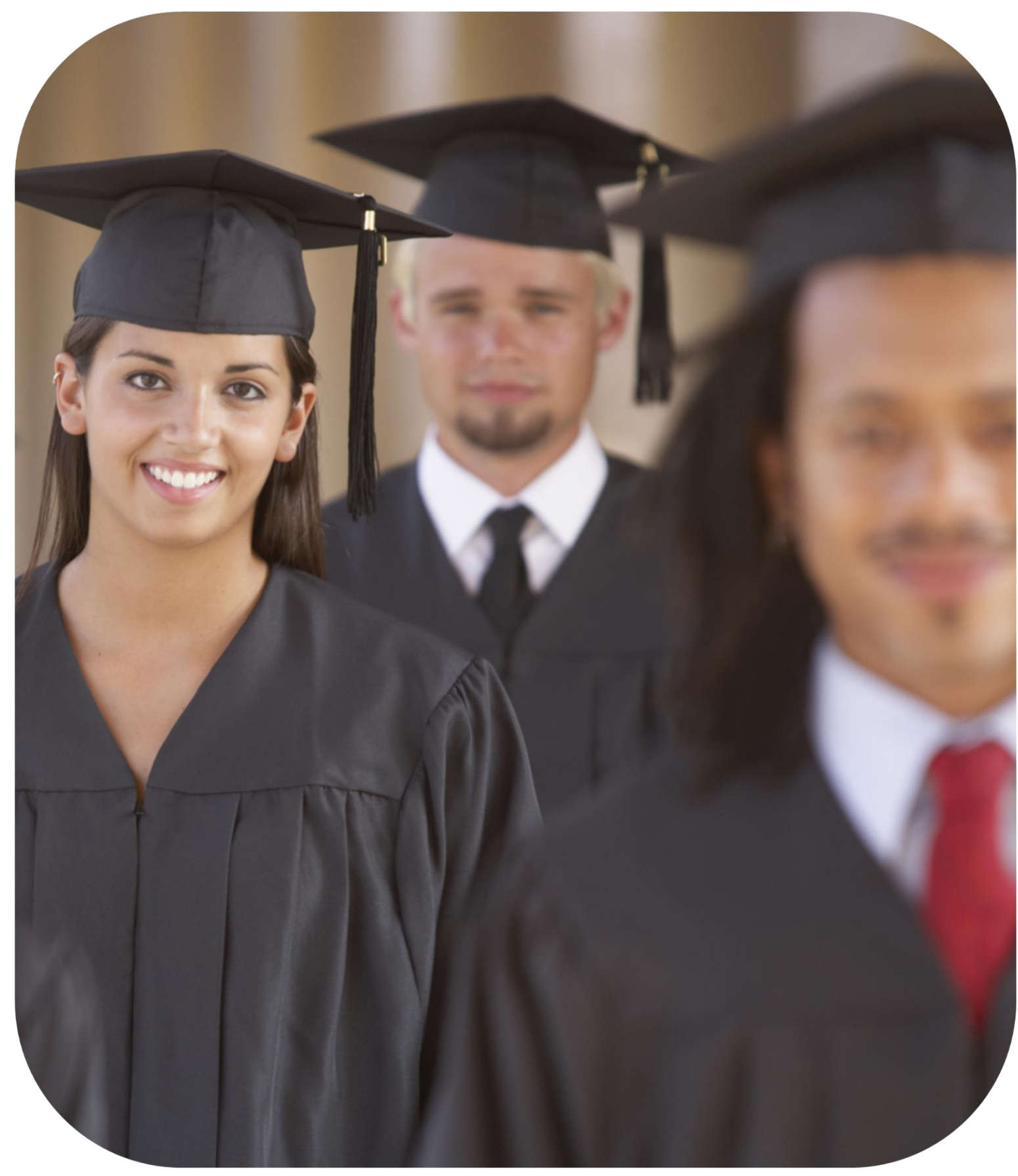
FISCAL YEAR 2019-20 FINANCIAL AID REPORT