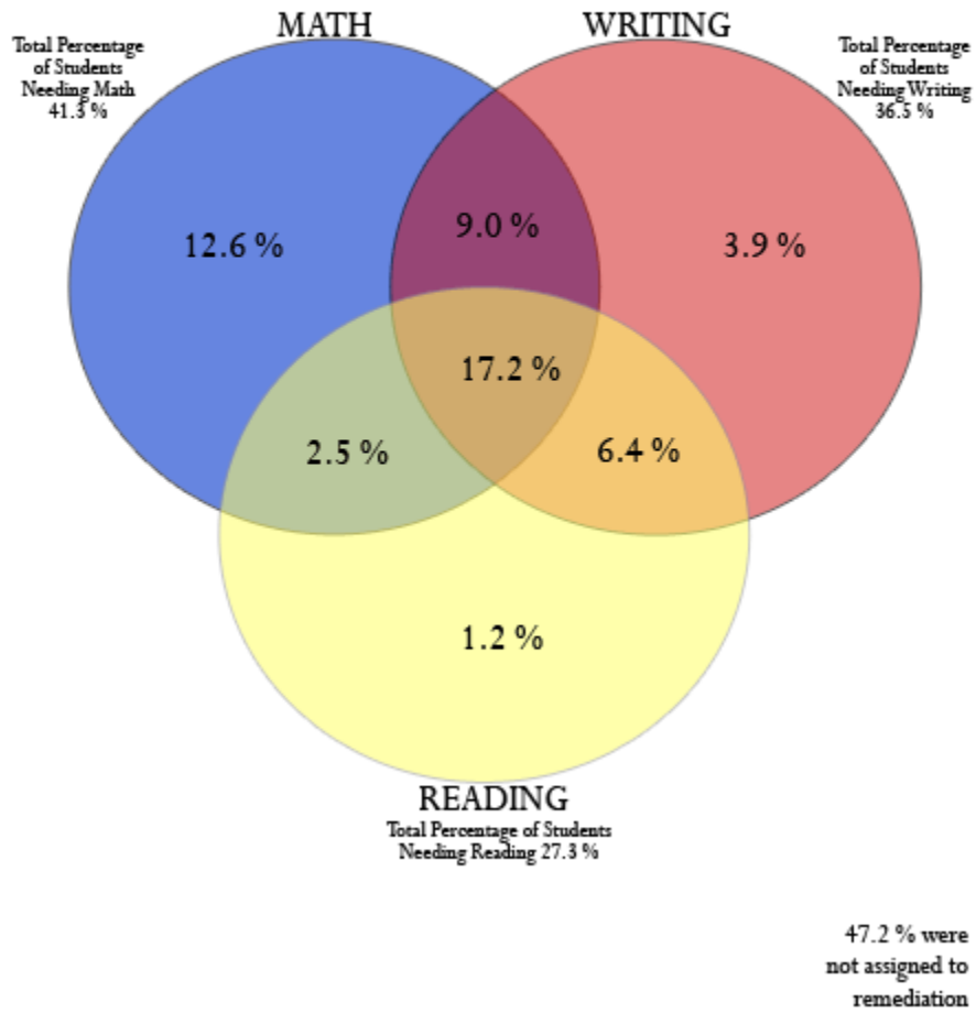
FIGURE 1: Recent High School Graduates Requiring Remediation Two Year Public Institutions (Calculated Jan 2011 for Fall 2009 incoming freshman)