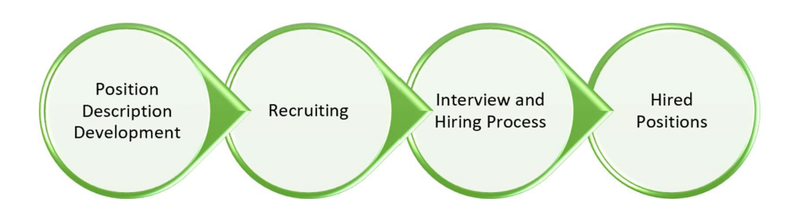
Figure 3: Recruitment Process and Tracking

The Department will conduct regular reviews of these processes and attempt to identify barriers and delays on both the process and position classification levels.