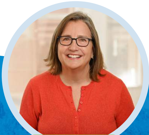
Chair of the Board

The Board of Directors of Connect for Health Colorado meets monthly to discuss and vote on a range of issues related to the operations of the Marketplace.