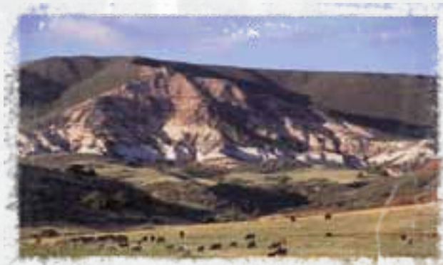
GOCO GRANTS AT WORK: Laramie Foothills Legacy, Larimer County