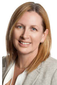
John W. Hickenlooper Governor, Colorado