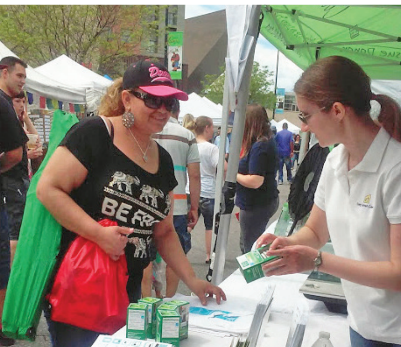
Sharing energy efficiency information at a Cinco de Mayo festival