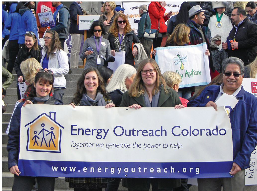
Attending a Colorado Gives Day rally at the State Capitol to promote philanthropic giving in Colorado.

Because of our expertise in consumer energy issues, EOC advocates on behalf of limited-income consumers at the local, state and national level to support equitable and affordable energy policies.