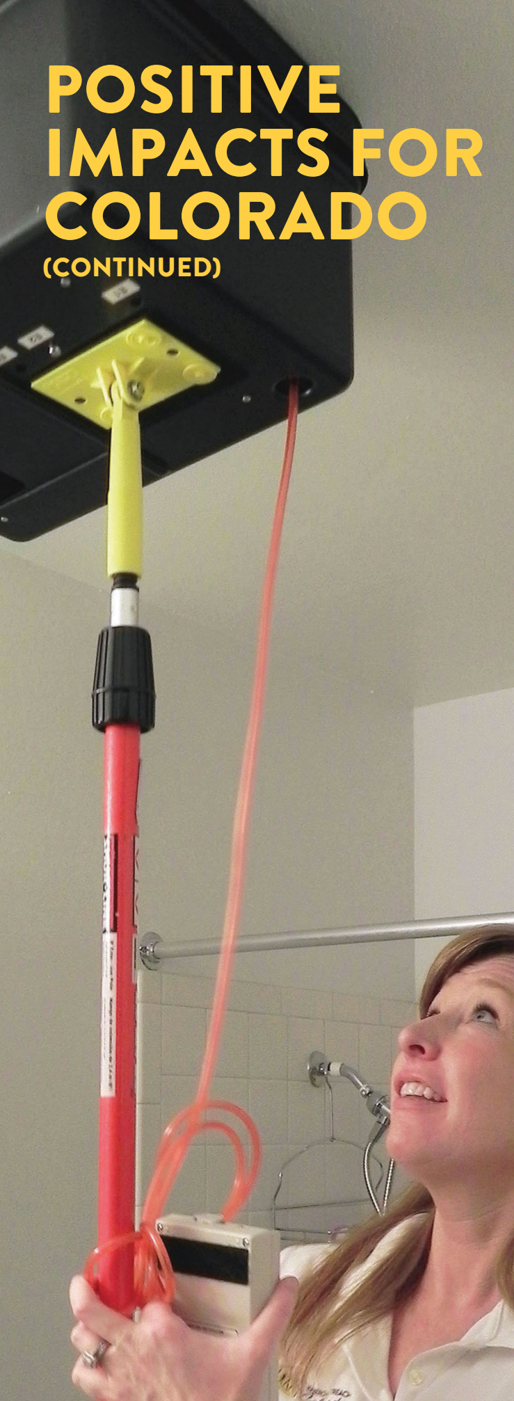
Testing airflow in exhaust fans in an affordable housing complex.