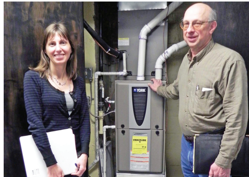
EOC installed a new furnace at a church that provides community outreach services.