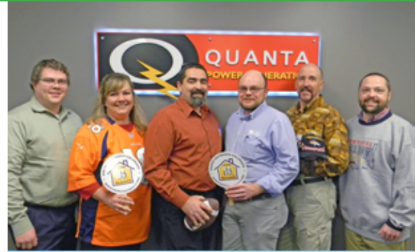
These Quanta Power Generation employees donated $1,200 from their football pool winnings to Energy Outreach Colorado to help struggling families and seniors remain warm and safe in their homes.