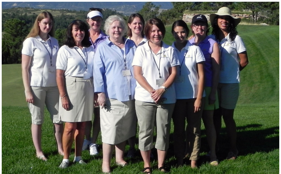
Energy Outreach staff and volunteers at the 2013 oil and gas industry golf tournament sponsored by Noble Energy and presented by RE/MAX International, which raised $200,000 for EOC's affordable energy programs.

“Thank you SO, SO much for the help. I truly do appreciate your help and will not take it for granted. You have blessed my home and our lives and given me a chance to maintain my employment and get back on track.”