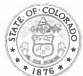
Jared Polis Governor

A handwritten signature in blue ink that reads "Jared Polis".