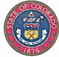
John W. Hickenlooper Governor

136 State Capitol Denver, Colorado 80203 Phone (303) 866-2471 Fax (303) 866-2003