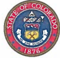
John W. Hickenlooper Governor

136 State Capitol Denver, Colorado 80203 Phone (303) 866-2471 Fax (303) 866-2003