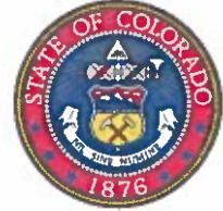
John W. Hickenlooper Governor

136 State Capitol Denver, Colorado 80203 Phone (303) 866-2471 Fax (303) 866-2003