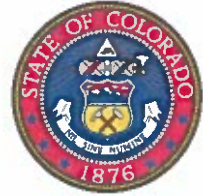
John W. Hickenlooper Governor

136 State Capitol Denver, Colorado 80203 Phone (303) 866-2471 Fax (303) 866-2003