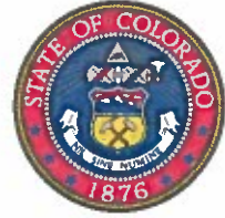
John W. Hickenlooper Governor

136 State Capitol Denver, Colorado 80203 Phone (303) 866-2471 Fax (303) 866-2003