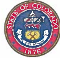
John W. Hickenlooper Governor

136 State Capitol Denver, Colorado 80203 Phone (303) 866-2471 Fax (303) 866-2003