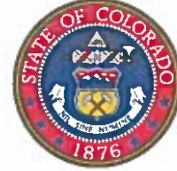
John W. Hickenlooper Governor