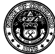
John W. Hickenlooper Governor

20195019472 C EXEC ORDER SECRETARY OF STATE 05/30/2019 04:37:54