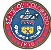
John W. Hickenlooper Governor

136 State Capitol Denver, Colorado 80203 Phone (303) 866-2471 Fax (303) 866-2003