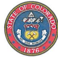
John W. Hickenlooper Governor

136 State Capitol Denver, Colorado 80203 Phone (303) 866-2471 Fax (303) 866-2003