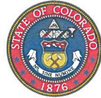
John W. Hickenlooper Governor

136 State Capitol Denver, Colorado 80203 Phone (303) 866-2471 Fax (303) 866-2003