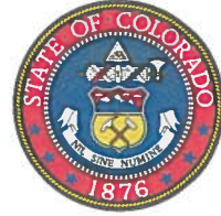
John W. Hickenlooper Governor

136 State Capitol Denver, Colorado 80203 Phone (303) 866-2471 Fax (303) 866-2003