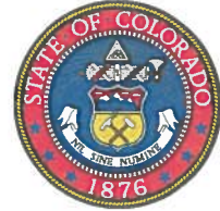
John W. Hickenlooper Governor

136 State Capitol Denver, Colorado 80203 Phone (303) 866-2471 Fax (303) 866-2003