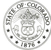
John W. Hickenlooper Governor

136 State Capitol Denver, Colorado 80203 Phone (303) 866-2471 Fax (303) 866-2003