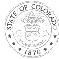
John W. Hickenlooper Governor

136 State Capitol Denver, Colorado 80203 Phone (303) 866-2471 Fax (303) 866-2003