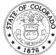
John W. Hickenlooper Governor

136 State Capitol Denver, Colorado 80203 Phone (303) 866-2471 Fax (303) 866-2003