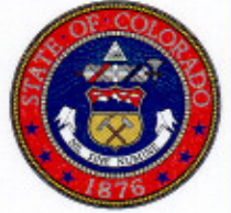
Bill Ritter, Jr. Governor

136 State Capitol Building Denver, Colorado 80203 (303) 866 - 2471 (303) 866 - 2003 fax