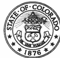
Bill Ritter, Jr. Governor

136 State Capitol Building Denver, Colorado 80203 (303) 866 - 2471 (303) 866 - 2003 fax