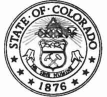
Bill Ritter, Jr. Governor

136 State Capitol Building Denver, Colorado 80203 (303) 866 - 2471 (303) 866 - 2003 fax