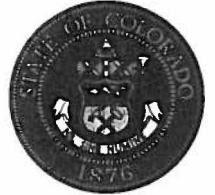
Bill Ritter, Jr. Governor

136 State Capitol Building Denver, Colorado 80203 (303) 866 - 2471 (303) 866 - 2003 fax