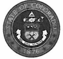
Bill Ritter, Jr. Governor

36 State Capitol Building Denver, Colorado 80203 (303) 866 - 2471 (303) 866 - 2003 fax