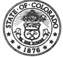
Bill Ritter, Jr. Governor

136 State Capitol Building Denver, Colorado 80203 (303) 866 - 2471 (303) 866 - 2003 fax