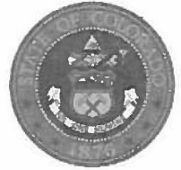
Bill Ritter, Jr. Governor

OFFICE OF THE GOVERNOR 136 State Capitol Building Denver, Colorado 80203 (303) 866 - 2471 (303) 866 - 2003 fax